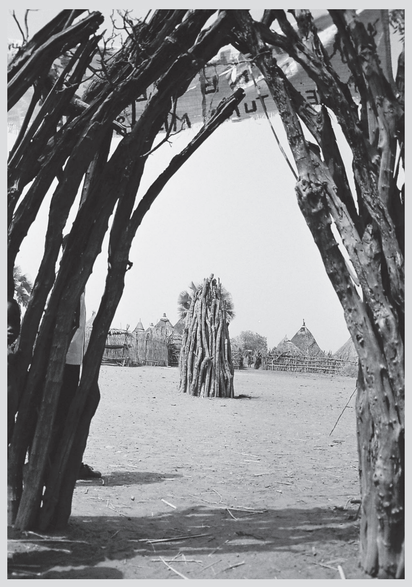
The pole-shrine and ceremonial ground of Mura-Hatiha

"Religion in its broadest sense, then, must be another term for that obscurity that surrounds man's efforts to defend himself by curative or preventative means against his own violence."