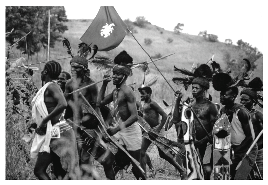
Lokoya age-mates in festive attire on the way to the New Year celebrations, Liria, 1986; note the syncretistic elements.

This book relates and reconstructs the dramas played out by the historic kings of the Bari, Lotuho, Lokoya, Pari and Lulubo. Since these societies did not have writing, we have to rely on oral traditions and on the observations of explorers, traders, colonial officials and missionaries who dealt with the kings before the colonial administration drastically curtailed their freedom to deal with their subjects as they felt fit, and vice-versa. Almost 80 years elapsed between the first contacts of explorers, traders and missionaries with local royalty and the effective establishment of colonial rule which only occurred when the Lotuho, Lokoya, Lulubo and Pari were incorporated into the Anglo-Egyptian Sudan in 1914. Only the Bari underwent a measure of administration under the Uganda Protectorate (1898–1914). The Turco-Egyptian (1871–1885) and Mahdist administrations (1888–1898) hardly interfered in the relationship between local rulers and their subjects.