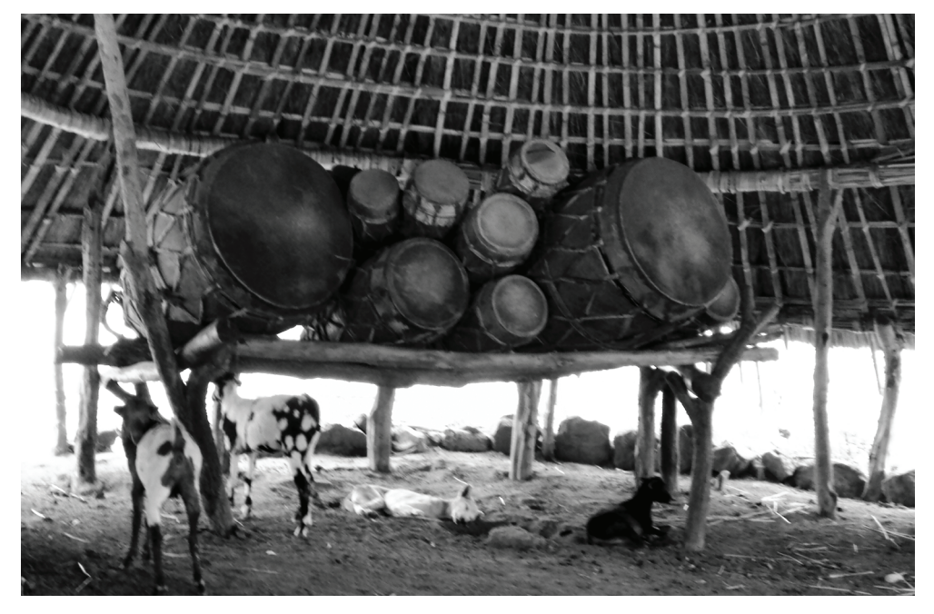
The royal drums of Loronyo, the capital of Lotuho kings of the Mayya Dynasty, 2009