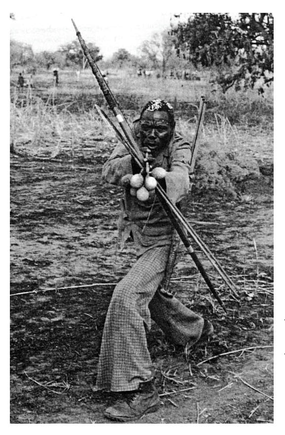
War hero making a mock-charge at the camera. The wild cucumbers hanging from his bow and those squeezed on his head protect the people he interacts with from contamination with the violence this killer of one or more enemies is associated with. In the Nilotic world the wild cucumber is a common substitute of a sacrificial victim.

sacralising effects primarily impinge on the victim but they may also reflect on the community and on the official in charge of the killing.