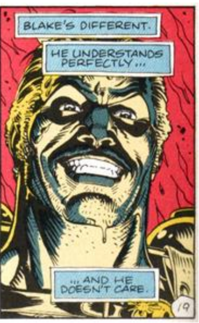
The Comedian during the Vietnam war