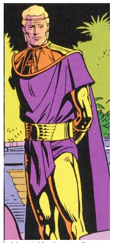
Adrian Veidt, Ozymandias

Despite his theatrical appearance, The Comedian is a powerful character. He's feared as a tough Vietnam veteran and distrusted as one of two Watchmen who keeps working for the American government after masked superheroes are officially banned. He becomes an immediate enemy to Adrian Veidt, who's known as "Ozymandias" and is regarded as "the smartest man on the planet" 11.